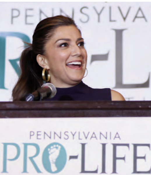
Rachel Campos-Duffy held the audience spellbound with her brand of truth upon truth.