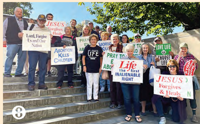
PHOTO 8 Bradford County Pennsylvanians for Human Life group traveled to Harrisburg for the first annual Pennsylvania Rally for Life .